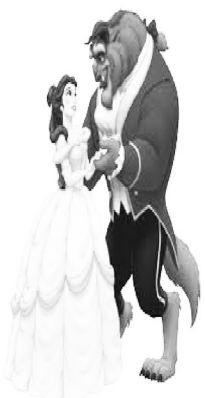
BEAUTY & THE BEAST